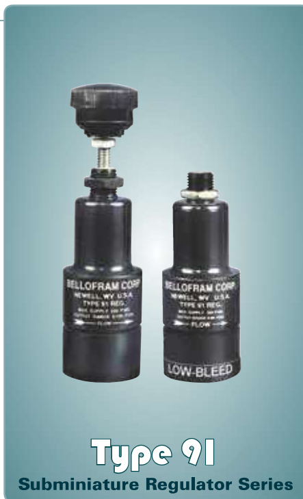
Type 91 Subminiature Regulator Series