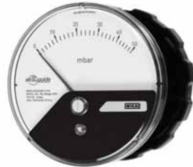
Differential Pressure Gauge Model A2G-10