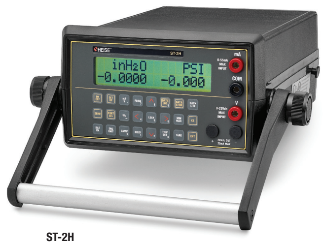
Heise Digital Indicator