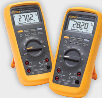
Fluke 28 II/27 II