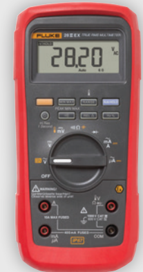
Fluke 28 II Ex