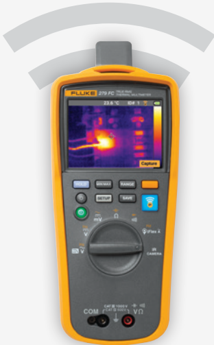
Fluke 279 FC