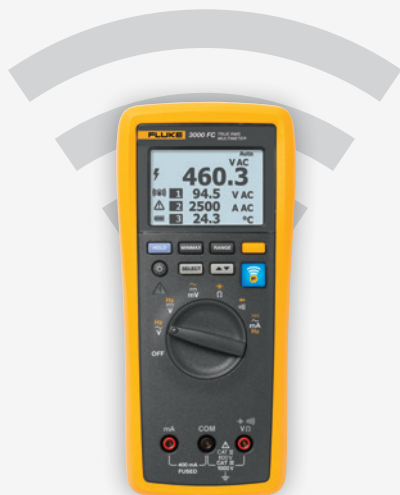
Fluke 3000 FC