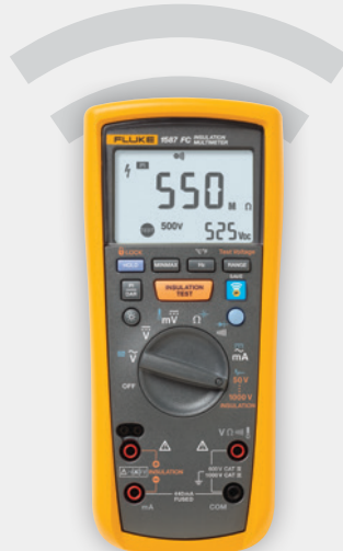
Fluke 1587 FC