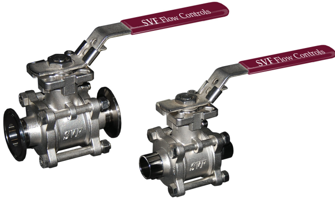
SB9 CleanTECH™ Ball Valve shown with TR ends (left) and ETO ends.