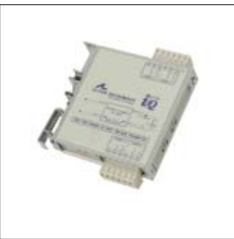
Q501-1xxx (1 channel out) Q501-2xxx (2 channel out)