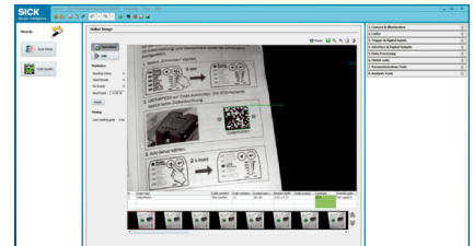
SOPAS interface, a comprehensive configuration and monitoring tool which makes possible a clear view of the read process.