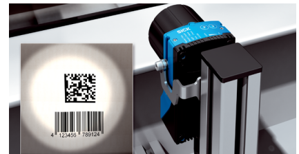
Traceability of products in the production process