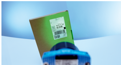
Acoustic and optical feedback. Immediate read feedback in all environments thanks to the green LED and acoustic signal.