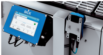
Identification of molds using the Asset Monitoring System

The Lector63x offers an optimum combination of performance and flexibility in a compact housing. It is ideal for applications which required high resolution, good scanning performance and high read ranges. The Lector63x detects small codes and codes on small objects with ease.