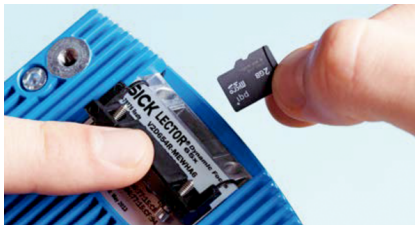
Slot for microSD memory card. Parameter cloning and storage of images.