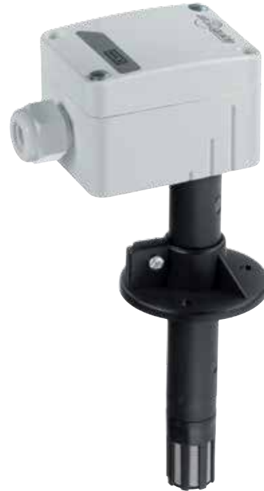
Duct sensor for relative humidity and temperature Type A2G-70